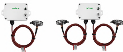
[R718BC / R718BC2] Clamp Probe

Various Probe Options with Wide Temperature Ranges