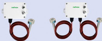
[R718B122 / R718B222] Magnetic Probe