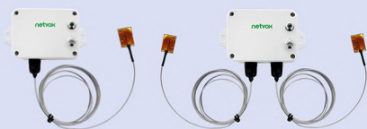
[R718BP / R718BP2] Patch Probe