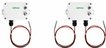
[R718B120 / R718B220] Round Head Probe